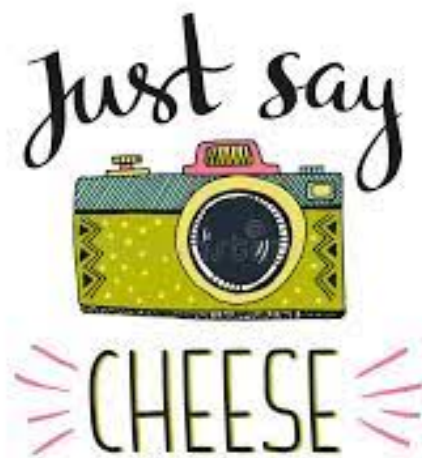
Photo Op for Rotarians

There will be a photo opportunity for Rotarians at the Sanibel School at 8:00 a.m. on Wednesday, April 28. We will be congratulating the winners of the Four Way Test essay contest with a plaque presentation! Wear your Rotary shirt, and please wear a mask.