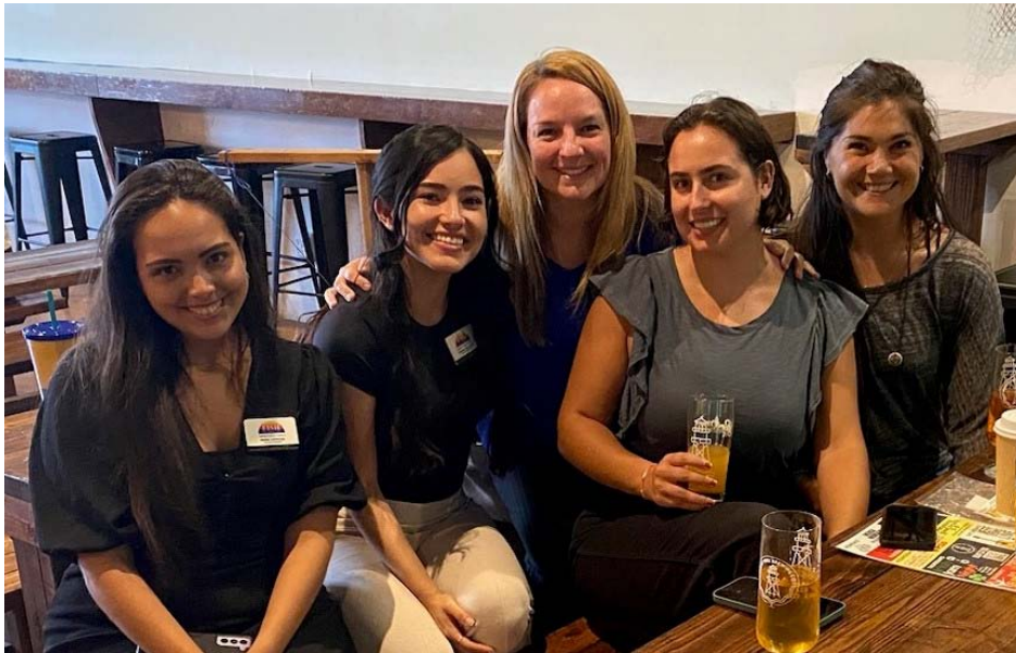
Fun times at last week's Happy Hour!