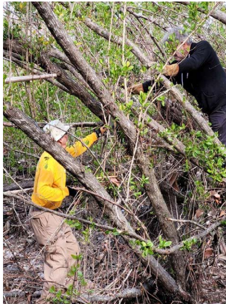
This past week's crew!

Thanks to all Rotarians for placing Service above Self!