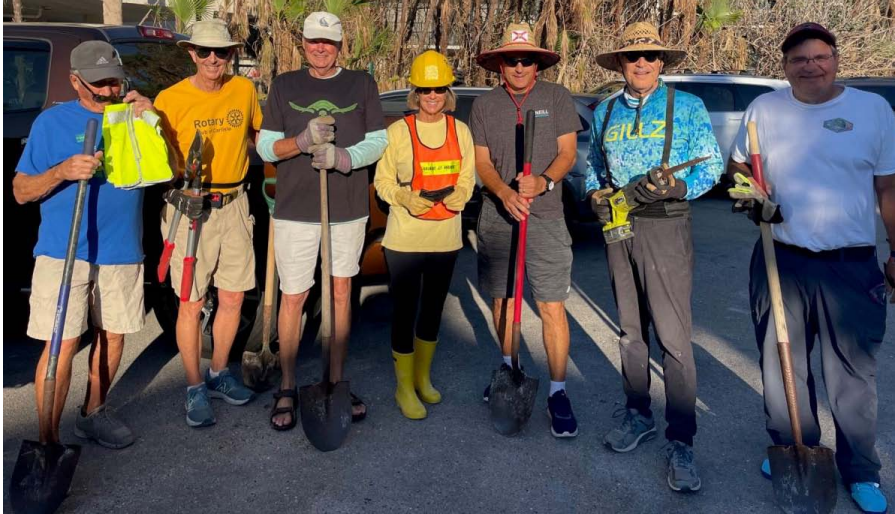
This past week's crew!

SCCF and the Sanibel-Captiva Rotary Club have recently teamed up to work together to remove partially buried beach debris found on our beaches. This debris can not be removed by hand, so shovels and saws have been necessary.