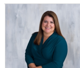
District Assistant Governor AG