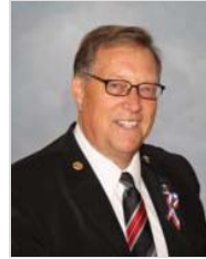
District RLI Chair