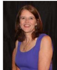
District Assistant Governor AG