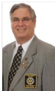
TRF - District The Rotary Foundation Chair