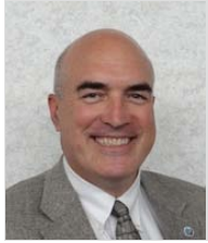
District Peace & Conflict Resolution Chair