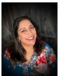
District Assistant Governor AG