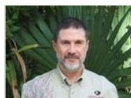
District Environment Chair