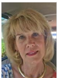
District CART Chair