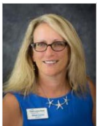
District Human Trafficking Chair