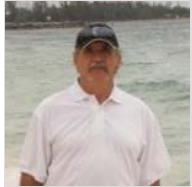
District S4TL Chair