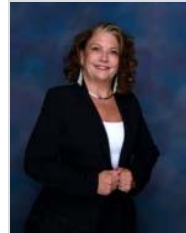
District Public Image/PR Chair