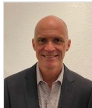
District Assistant Governor AG