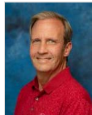
District Assistant Governor AG