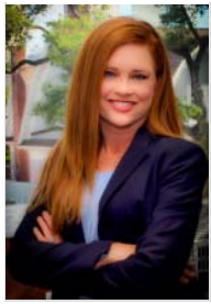
District COG, Chancellor