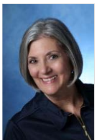
District Diversity & Inclusion Chair