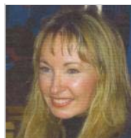
District International Services Chair