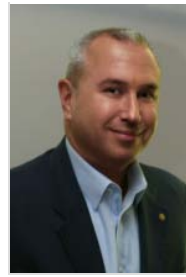
District Membership Chair