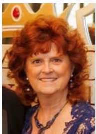
District Executive Secretary/Administrator