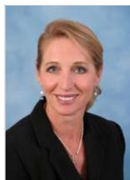
District CART Chair