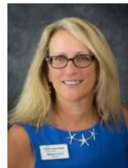
District Human Trafficking Chair