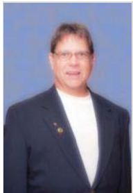
District Sgt. at Arms