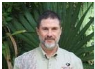
District Environment Chair