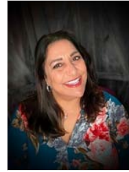
District Assistant Governor AG