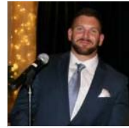
District Assistant Governor AG