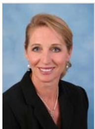
District CART Chair