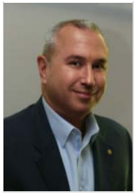
District Membership Chair