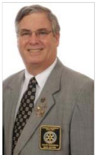
TRF - District The Rotary Foundation Chair