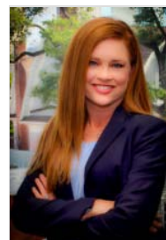
District Legal Counsel