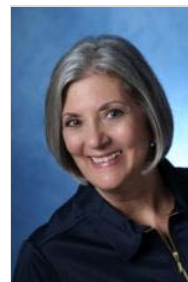
District Diversity & Inclusion Chair