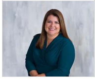
District Assistant Governor AG