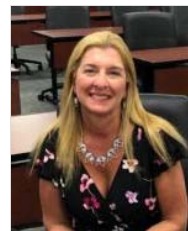
District Assistant Governor AG