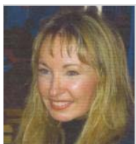
District International Services Chair