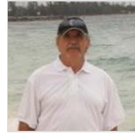
District Rotary Youth Exchange Chair