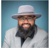
District Public Image/PR Chair