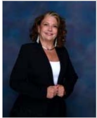
District RLI Chair