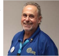
District S4TL Chair