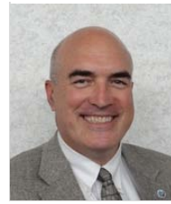
District Peace & Conflict Resolution Chair