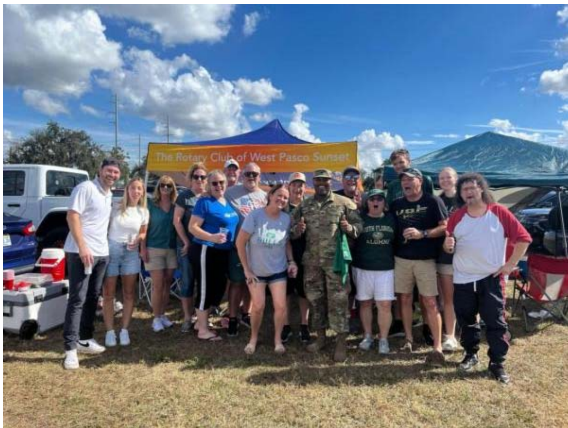
Members of the Club enjoyed a fun-filled day of fellowship at the November 9 USF v Navy game at Raymond James Stadium. USF didn't get the win, but everyone had a wonderful time. Stay tuned for more opportunities to support our home-town teams and enjoy each other's company!

"One Profits Most, Who Serves Best, Service Above Self"