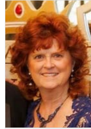
District Executive Secretary/Administrator