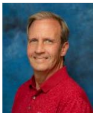
District Assistant Governor AG