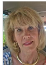
District CART Chair