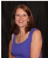
District Assistant Governor AG