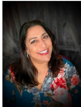
District Assistant Governor AG