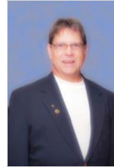
District Sgt. at Arms