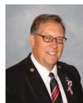
District Membership Chair