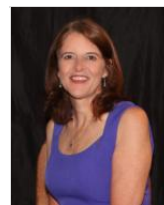
District Assistant Governor AG