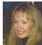
District International Services Chair