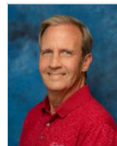
District Assistant Governor AG