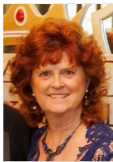
District Executive Secretary/Administrator