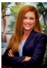
District Legal Counsel