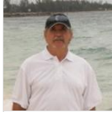
District Rotary Youth Exchange Chair