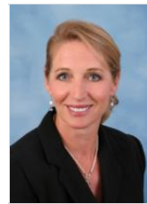
District CART Chair