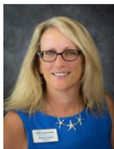
District Human Trafficking Chair