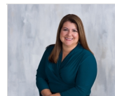
District Assistant Governor AG