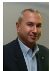
District Past Governor PDG