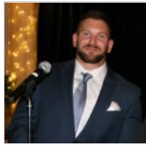
District Assistant Governor AG