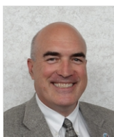
District COG, Chancellor