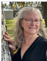
District Assistant Governor AG