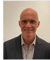
District Assistant Governor AG