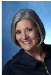
District Diversity & Inclusion Chair