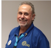
District S4TL Chair