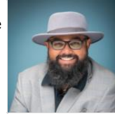
District Public Image/PR Chair