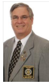
TRF - District The Rotary Foundation Chair