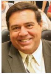
District Peace & Conflict Resolution Chair