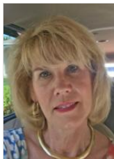
District CART Chair