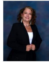
District RLI Chair