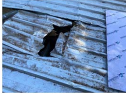
Hole in roof of tiny home

The Rotary Club of Mayaguez received our team graciously and sent a generous donation of $2000 to our District to help with our own Hurricane disaster relief. As Rotarians, we appreciate each other as one big Rotary family.