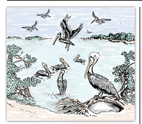
Issue 31: May 1, 2024