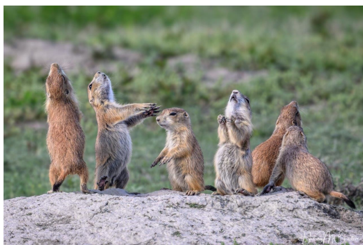
Morning Prairie dog prayer ritual! - @hilarybralove

The photos below are from a deepsea expedition in a Pacific Mining Zone. Read more about it here: