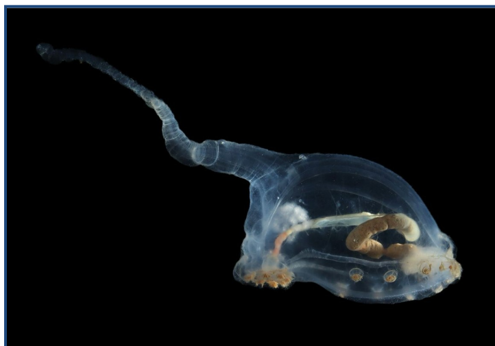
A transparent deep-sea creature called a unicumber

The photos below are from a deepsea expedition in a Pacific Mining Zone. Read more about it here: