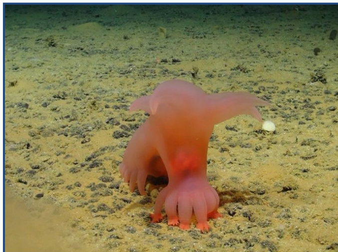
A Barbie-pink sea pig saunters along the seafloor