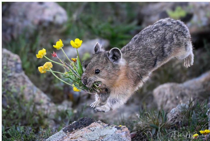
American Pika