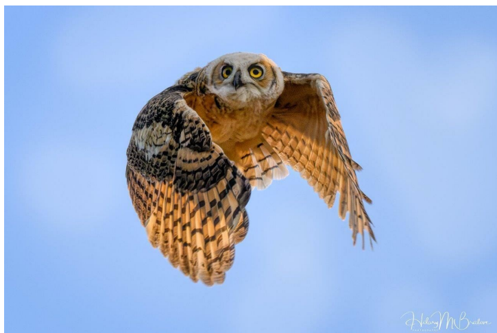
Newly fledged Great Horned Owl