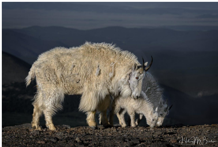
Mountain goat with baby