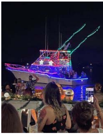
Lighted Boat Parade.