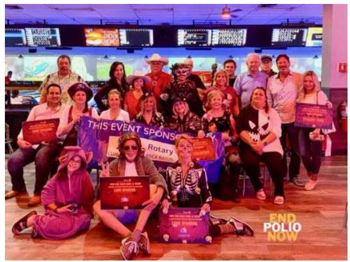
Boca Raton West Club: