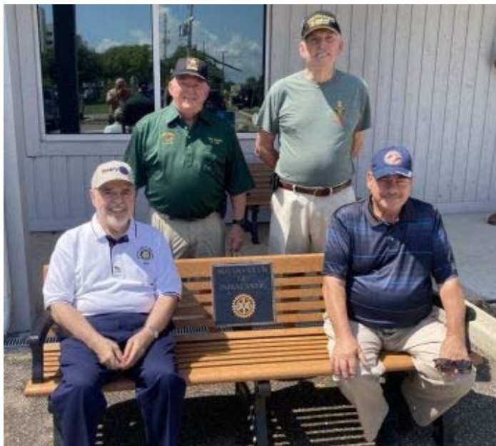
Port St. Lucie Club: scholarships