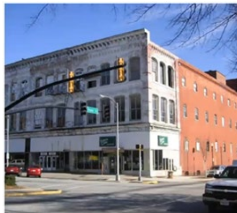
476 Third - Before Redevelopment

She then offered several examples of small businesses downtown that have been helped by NewTown's support.