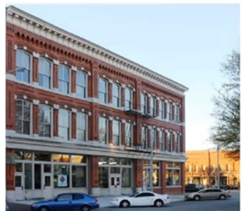
476 Third - 64 Loft Units & 2 Commercial Spaces Later