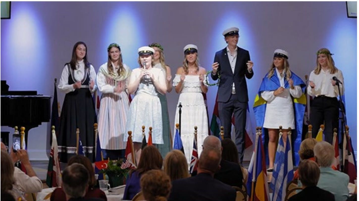
from the video of the GRSP program