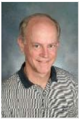
Graham Thorpe 28 Years