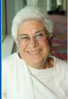
Blair Train Club Admin Chair