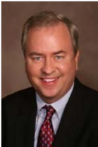
Graham Thorpe October 16th