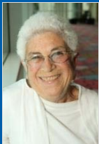
Blair Train Club Admin Chair