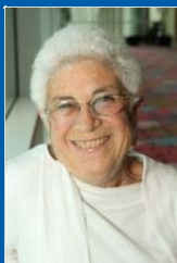
Blair Train Club Admin Chair