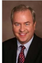
Graham Thorpe October 16th