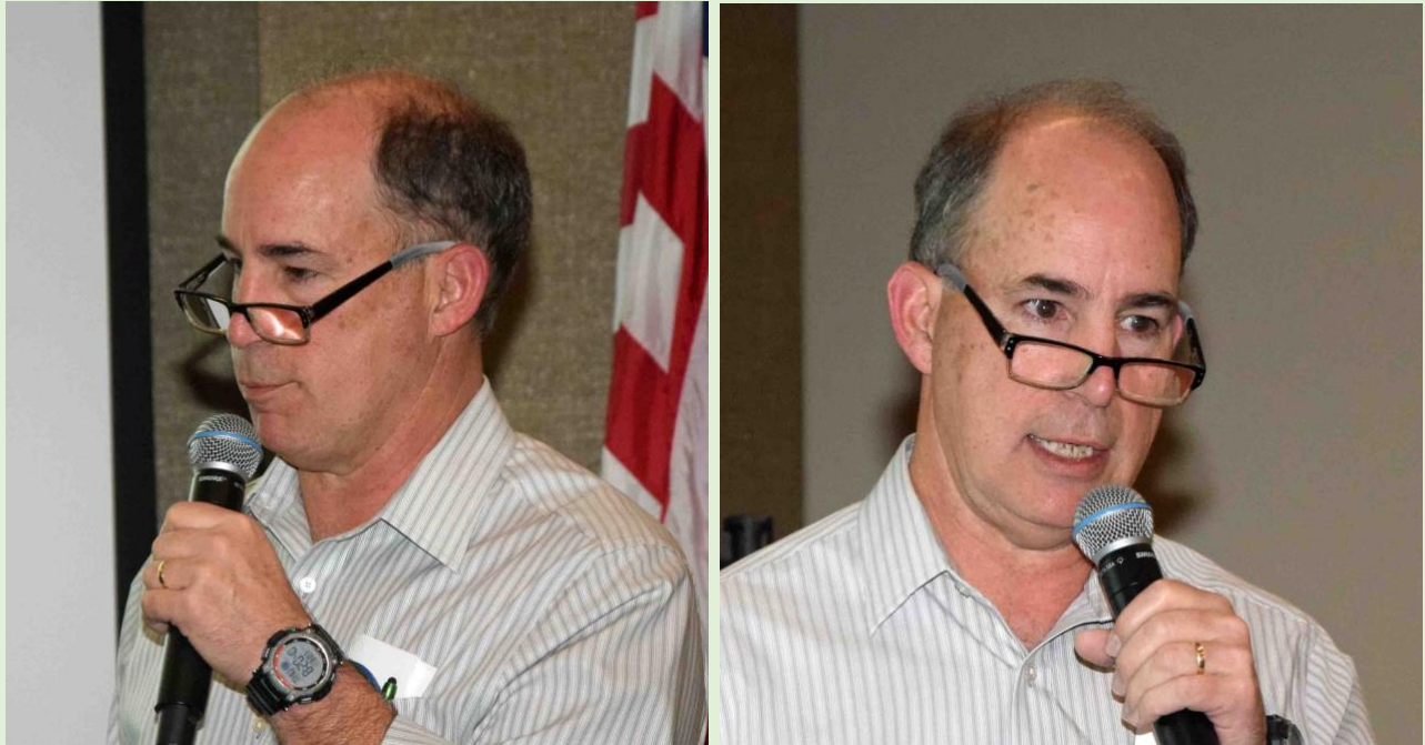
GAVE A VIVID DISPLAY ABOUT COLON AND COLORECTAL CANCER IDENTIFICATION AND TREATMENT