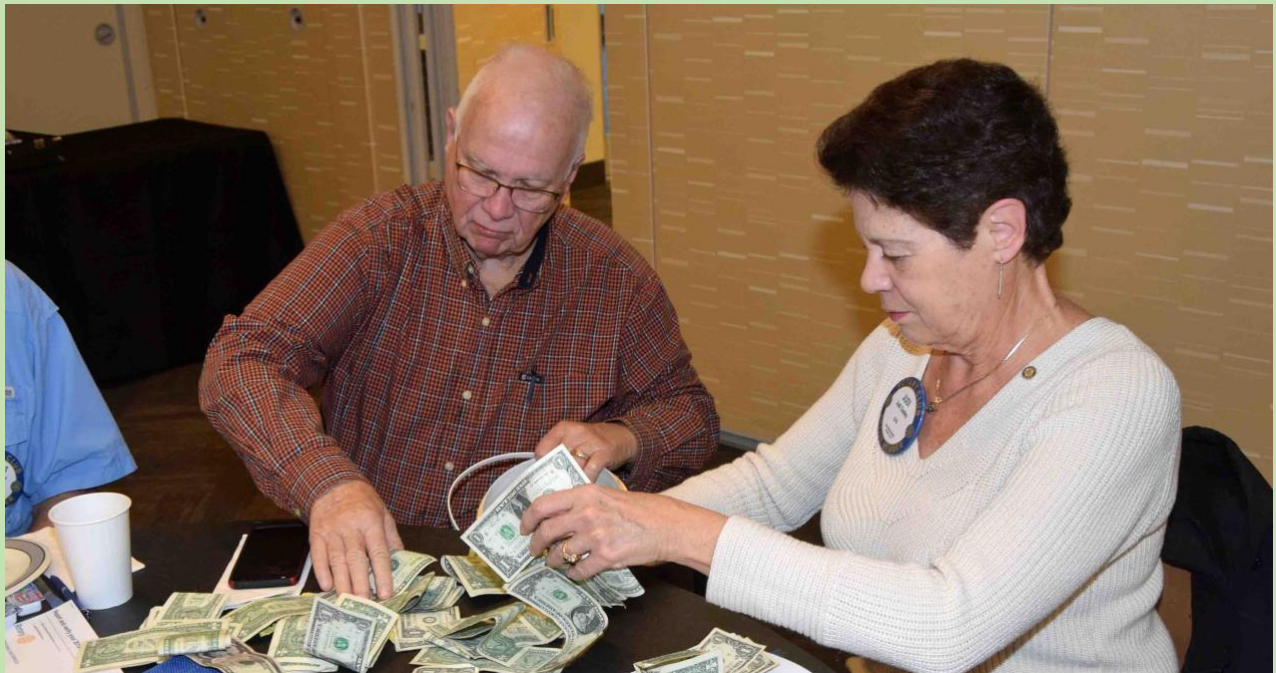
MATTHEW 21:12 AND A FEW OTHER GOSPEL QUOTES DESCRIBE THE TURNING OVER OF THESE TABLES