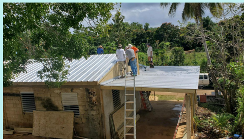
Some of our "Roof Warriors" in action.