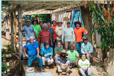
The group of volunteers with the homeowner.