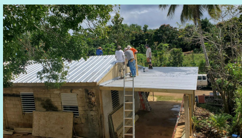
Some of our "Roof Warriors" in action.