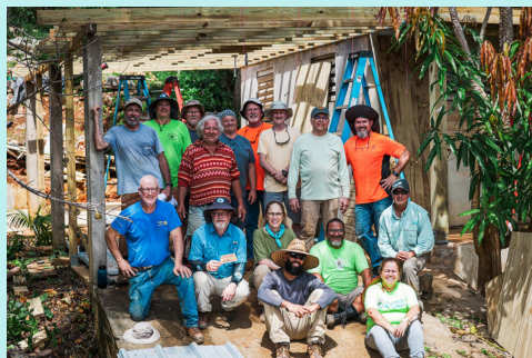
The group of volunteers with the homeowner.