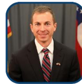
Senator Greg Dolezal