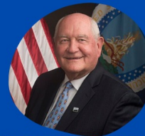
DR. SONNY PERDUE Chancellor and Former Georgia Governor