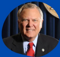
NATHAN DEAL Former Governor