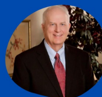
ROY BARNES Former Governor