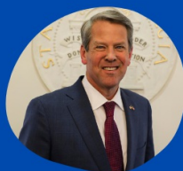
GOVERNOR BRIAN P. KEMP