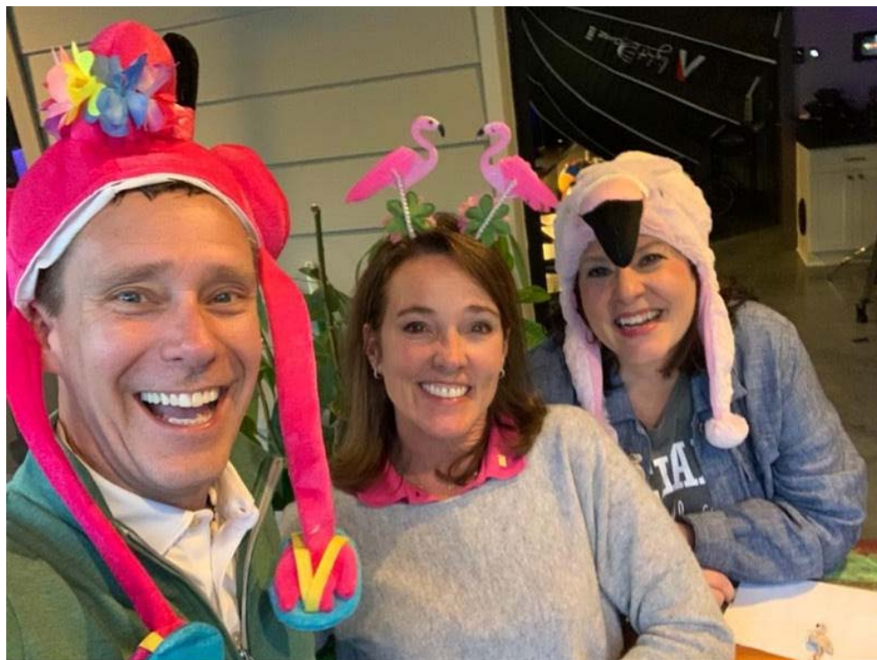
2021 Rotary District 6910 virtual Conference