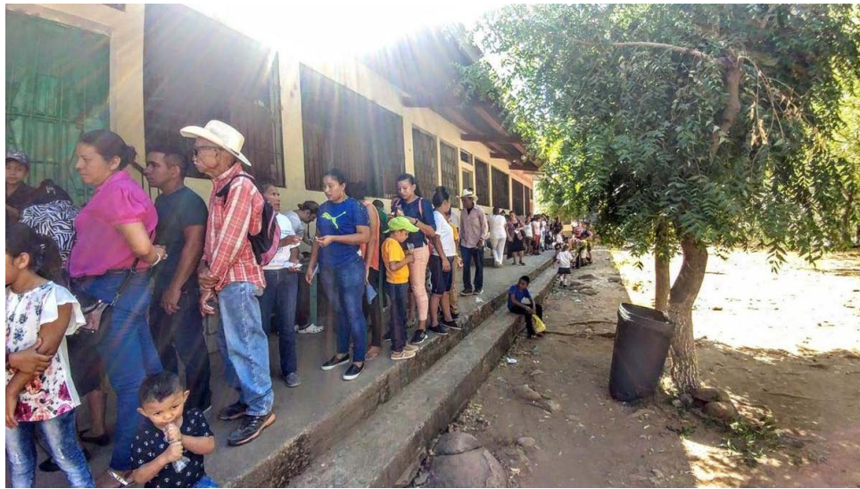
Honduran villagers line up for a clinic sponsored by Central American Relief Efforts, Rotary Club of Lancaster and First Presbyterian Church, Lancaster

Those wishing to donate or to take part in a trip to Honduras can contact the organization at carelif07@gmail.com .