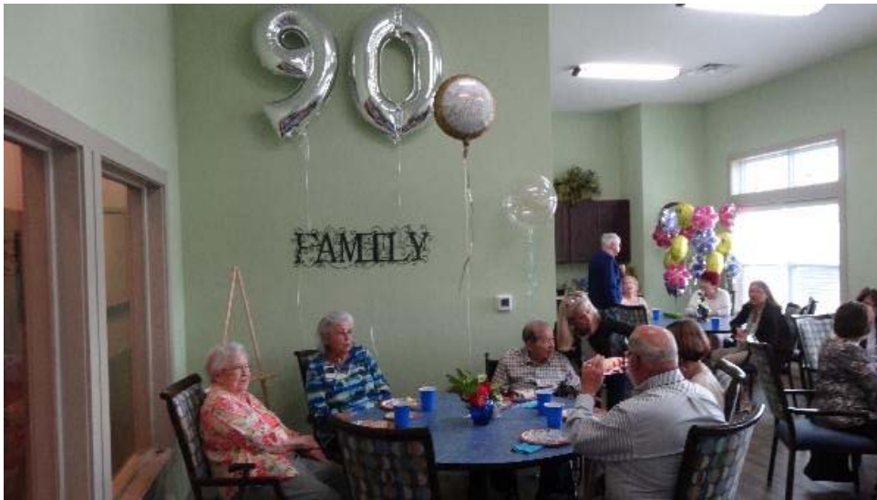
There was a good crowd to celebrate number 90