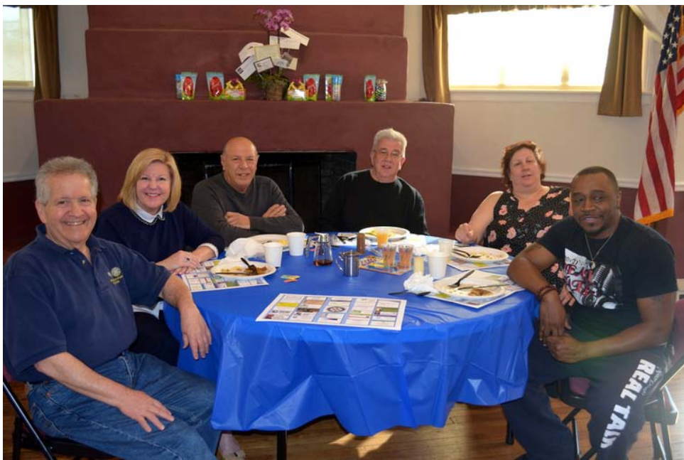
The Fanwood-Scotch Plains Rotary Club has served the community since 1938. Meetings are held on Wednesdays at noon at the Stage House Restaurant. Guests are invited to attend and learn about the good that Rotary is doing worldwide. For further information, go to fsprotary.org or visit the Facebook page.