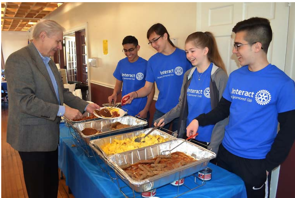
SCOTCH PLAINS/FANWOOD, NJ -- The Scotch Plains-Fanwood Rotary Club hosted its second annual All-You-Can-Eat Pancake Breakfast at Shady Rest Country Club (820 Jerusalem Road, Scotch Plains) on Sunday, April 7. Attendees included Fanwood Mayor Colleen Mahr, Scotch Plains Mayor Al Smith and members of the Scotch Plains Township Council, among others.