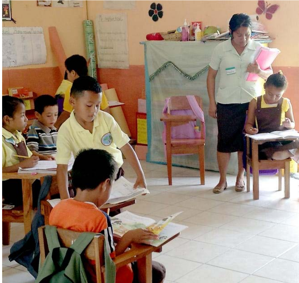
Interior of Libertad RC School, after renovation funded by Rotary.