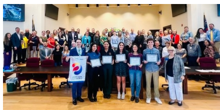
Six local students received $1,000 scholarships from the Rotary Club of Canton.

This year, one of the culminating services of our club is to present six $1,000 scholarships to local students. While we are blessed to live in a state with 34 public colleges and universities and 22 technical colleges, tuition is free with an A or B average under the HOPE Scholarship. However, this does not cover a myriad of fees from athletics to parking, which, in some schools around the country, equals the price of tuition. So, our funds are well spent on aiding students to be able to participate in further education. In one such program called Book Buddies, Rotarians read books together with teachers, assisting with phonemic awareness, context and comprehension skills.