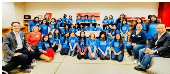
Canton Rotarians pose with students from Teasley Middle School at the conclusion of a tremendous Career Day event.

The Rotary Club of Canton is peopled by eminent educators, scientists, education professionals, and school board members, all of whom help and support the literacy initiatives in eclectic ways. With the prevalence of STEM schools in Cherokee County, the Canton Rotary Club has funded a Hydroponics Lab for an elementary school, where we grow flowers and plants for a STEM program, emphasizing farm-to-table lessons where students grow vegetables for school lunches. We also sponsor the Robotics team at a local high school to assist with materials for building prosthetics and shipping them to other countries, which helps students advance their learning on the high school level in complex areas of science. In the Canton Club's efforts to be inclusive, a Sensory Lab for Autistic Children enhances their abilities to learn as well.