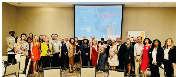
Rotarians from both District 6900 and 6910 meet in Atlanta to kick off a new year of the Georgia Laws of Life Essay Contest!

This year, one of the culminating services of our club is to present six $1,000 scholarships to local students. While we are blessed to live in a state with 34 public colleges and universities and 22 technical colleges, tuition is free with an A or B average under the HOPE Scholarship. However, this does not cover a myriad of fees from athletics to parking, which, in some schools around the country, equals the price of tuition. So, our funds are well spent on aiding students to be able to participate in further education. In one such program called Book Buddies, Rotarians read books together with teachers, assisting with phonemic awareness, context and comprehension skills.