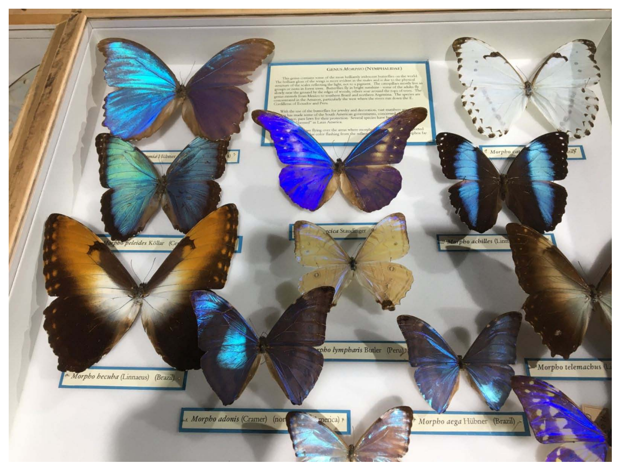
"The Classic City Rotary Club visits with some friends at the UGA Natural History Museum."