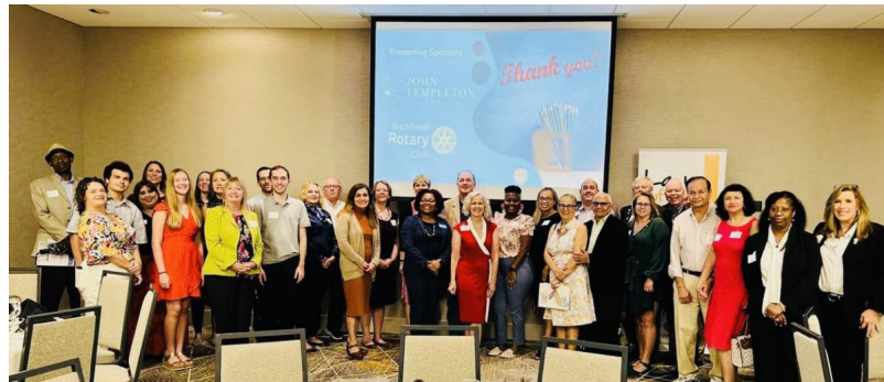
Rotarians from both District 6900 and 6910 meet in Atlanta to kick off a new year of the Georgia Laws of Life Essay Contest!

university and 22 technical colleges, tuition is free with an A or B average under the HOPE Scholarship. However, this does not cover a myriad of fees from athletics to parking, which, in some schools around the country, equals the price of tuition. So, our funds are well spent on aiding students to be able to participate in further education. In one such program called Book Buddies, Rotarians read books together with teachers, assisting with phonemic awareness, context and comprehension skills.