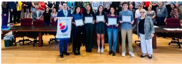
Six local students received $1,000 scholarships from the Rotary Club of Canton.

university and 22 technical colleges, tuition is free with an A or B average under the HOPE Scholarship. However, this does not cover a myriad of fees from athletics to parking, which, in some schools around the country, equals the price of tuition. So, our funds are well spent on aiding students to be able to participate in further education. In one such program called Book Buddies, Rotarians read books together with teachers, assisting with phonemic awareness, context and comprehension skills.