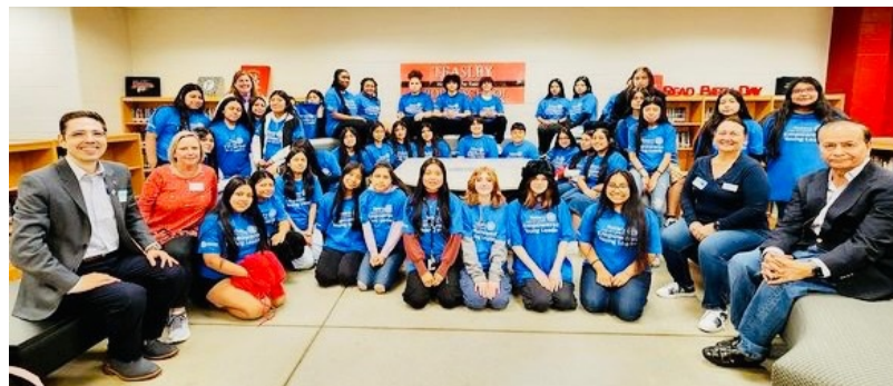
Canton Rotarians pose with students from Teasley Middle School at the conclusion of a tremendous Career Day event.

The Rotary Club of Canton is peopled by eminent educators, scientists, education professionals, and school board members, all of whom help and support the literacy initiatives in eclectic ways. With the prevalence of STEM schools in Cherokee County, the Canton Rotary Club has funded a Hydroponics Lab for an elementary school, where we grow flowers and plants for a STEM program, emphasizing farm-to-table lessons where students grow vegetables for school lunches. We also sponsor the Robotics team at a local high school to assist with materials for building prosthetics and shipping them to other countries, which helps students advance their learning on the high school level in complex areas of science. In the Canton Club's efforts to be inclusive, a Sensory Lab for Autistic Children enhances their abilities to learn as well.