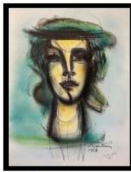
Head of a Girl with Hat, ca. 1980, Hand-colored with airbrush over offset lithograph, original charcoal drawing signed by artist in 1968, STAR

The winner does not have to be present at Founder's Day. The print can be shipped and will not be framed.