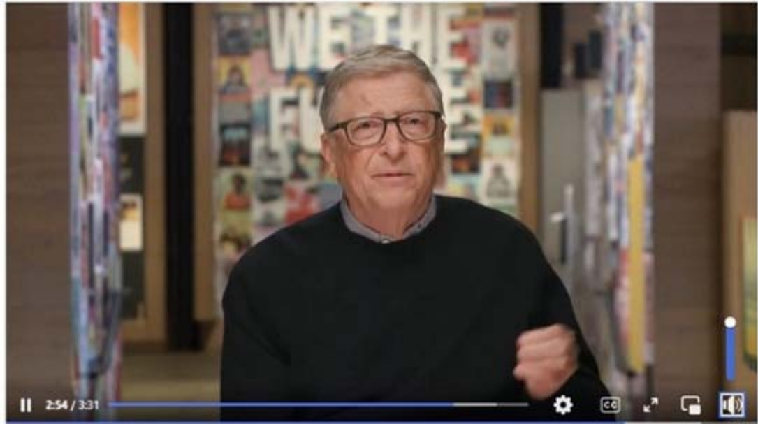
Together, We Can End Polio

Watch video: https://fb.watch/i2u0kOe-Oz/