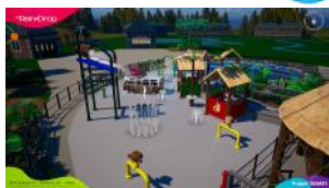
Stirring Water's Rain Forest Adventure