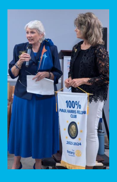
Last Meeting 9/19