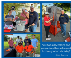
COMMUNITY HEALTH DAY!

Over the past two weeks, the RCT participated in two community service events. They were so different from one another and connected us to our neighbors in unique ways. Along the way, we learned more about the causes we support, earned the joy of service, appreciated the beautiful outdoors, and represented our club together. Thanks to those who made the effort to come!