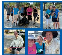
DOWNTOWN RIVER CLEANUP