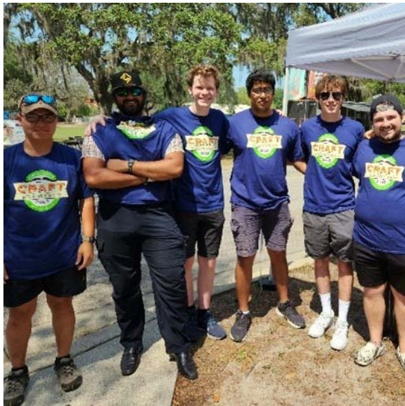
USF Rotaract Club