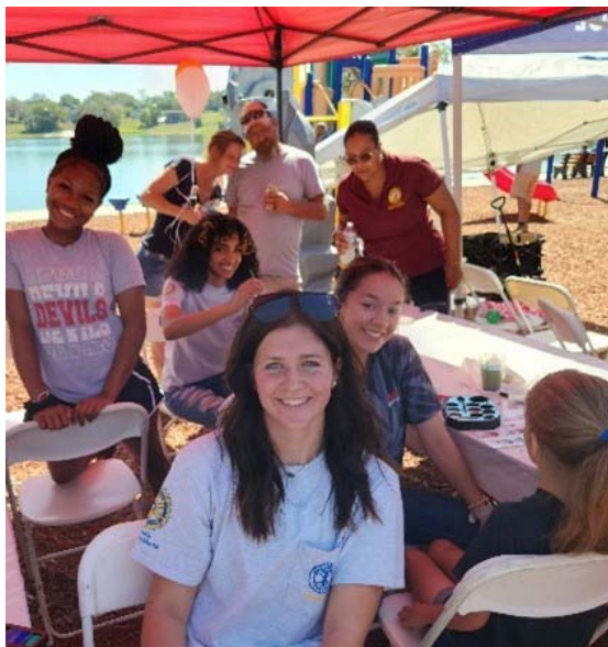
Avon Park High School Interact Club