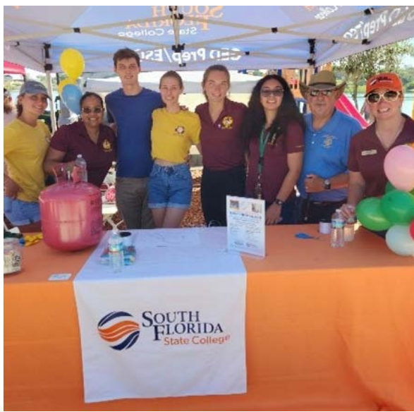
South Florida State Rotaract Club