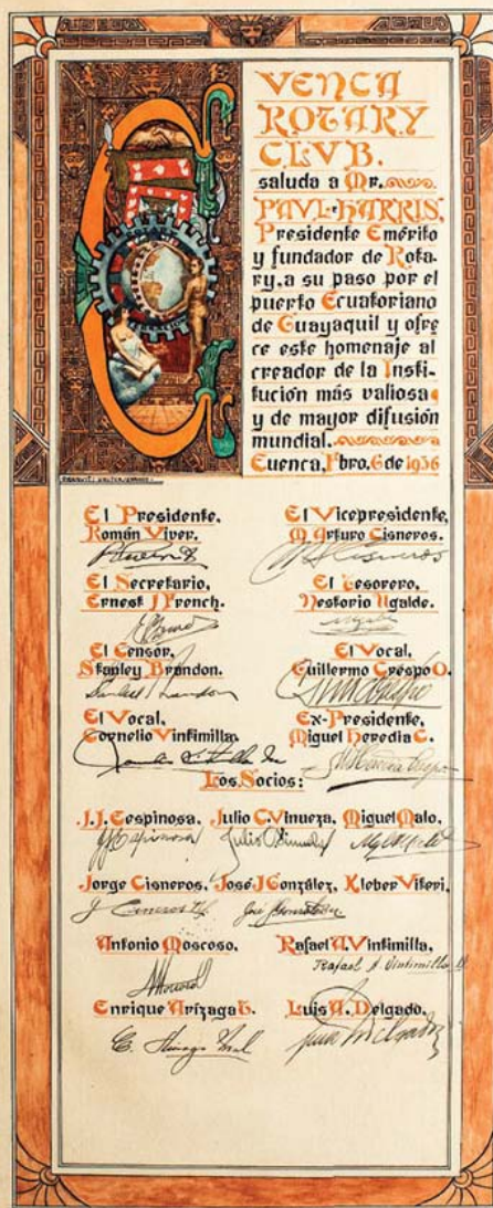
The Rotary Club of Cuenca memorialized Harris' visit to the Ecuadorian port city of Guayaquil with a scroll featuring an illuminated initial. Conservation included mending tears with Japanese tissue paper and wheat starch paste.