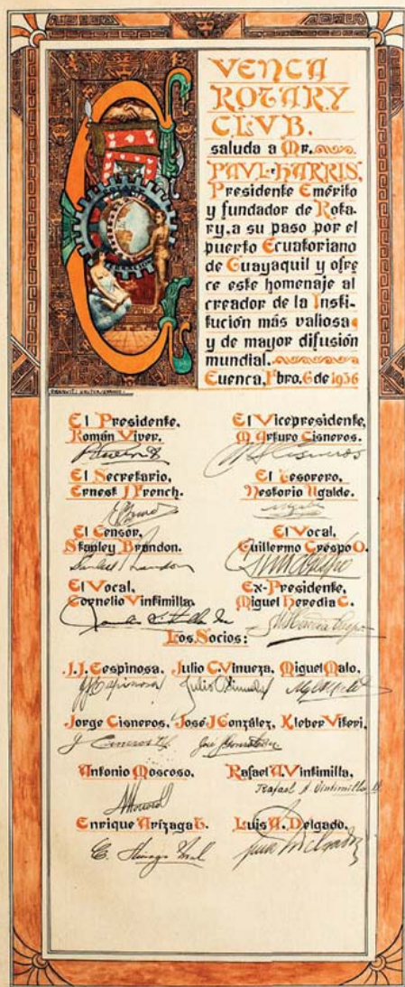
The Rotary Club of Cuenca memorialized Harris' visit to the Ecuadorian port city of Guayaquil with a scroll featuring an illuminated initial. Conservation included mending tears with Japanese tissue paper and wheat starch paste.