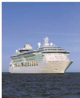
Brilliance of the Seas

March 27 Depart Tampa, FL March 28 At Sea March 29 Cozumel, Mexico March 30 Grand Cayman March 31 At Sea April 1 Arrive Tampa