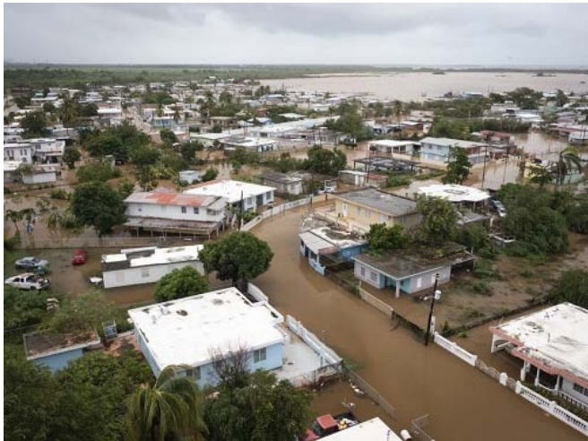
Puerto Rico following Hurricane Fiona

This year, although we have had very few storms that effected our Rotary Zone 34, they have been mighty.