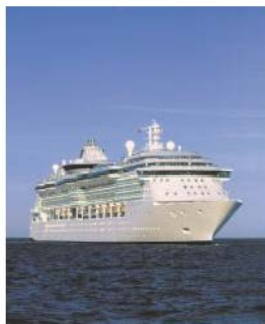
Brilliance of the Seas

March 27 Depart Tampa, FL March 28 At Sea March 29 Cozumel, Mexico March 30 Grand Cayman March 31 At Sea April 1 Arrive Tampa