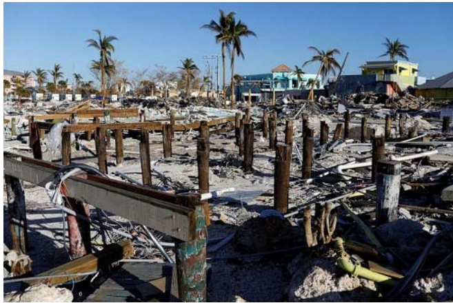
Fort Myers Beach following Hurricane Ian