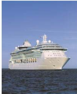
Brilliance of the Seas

March 27 Depart Tampa, FL March 28 At Sea March 29 Cozumel, Mexico March 30 Grand Cayman March 31 At Sea April 1 Arrive Tampa