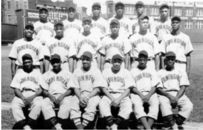
The Negro Southern League

Museum (NSLM) tells the story of African-American baseball in America through the eyes of Birmingham, Alabama. The museum features the largest collection of original Negro League baseball artifacts in the country. NSLM also features an on-site research center that is supported by a research team made up of seven of the top researchers in Negro League and Southern League baseball history. If you are looking for a one-of-a-kind experience please make plans to visit the Negro Southern League Museum. Whether you are a baseball enthusiast or a novice, the Negro Southern League Museum has something for you.