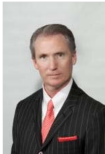
Bright Bruorton January 21st