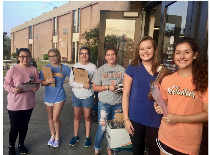
Six members of the Hardin Valley Academy Interact Club worked their first Flu Shot Saturday