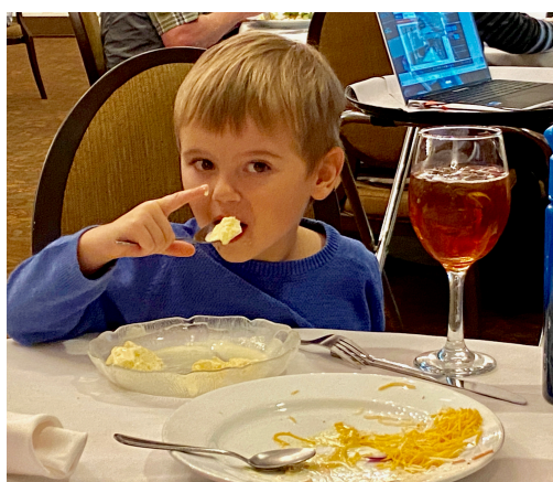
And he loves ice cream!!!