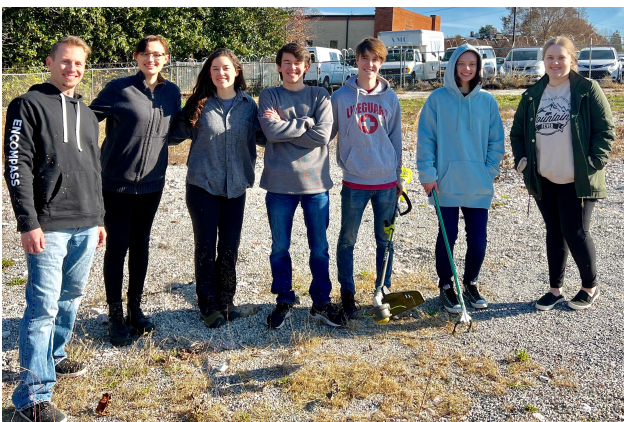
Pellissippi State's Rotaract team

We have a lot of pictures from the event and we'll share a few here and more on our Facebook page.