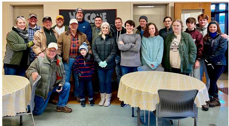
The Rotary work gang at VMC

Yesterday's project at the Volunteer Ministry Center (VMC) on a very cold Saturday morning was a huge success. We had 22 there, a combination of 14 Rotarians and kids and seven members of the Pellissippi State Community College Rotaract Club.