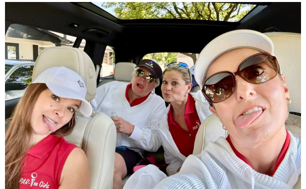
The Par Tee Girls having fun!!!