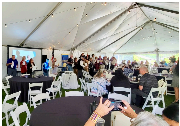
Dist. 6780 Conference doing its business under the tent