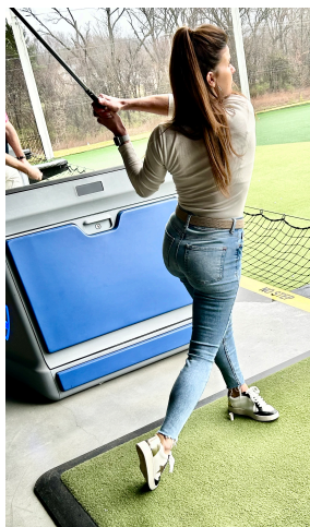
The Sonya Swing: Miz Ford killed it!